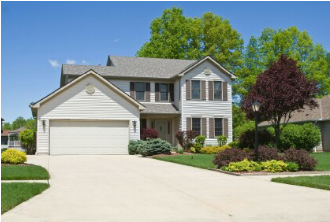
Example of a new concrete driveway