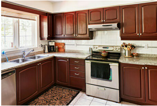
The color and style you selected for your cabinets.