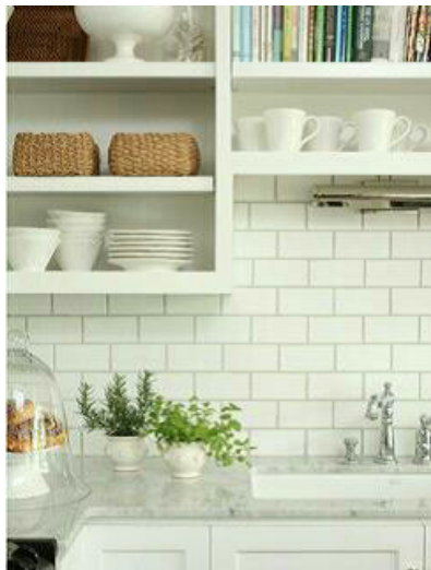
Backsplash Tile selection