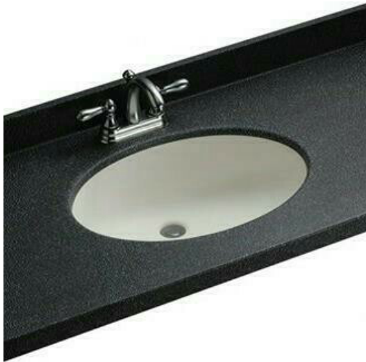
Example of under mount sink and new faucet. Model AR345