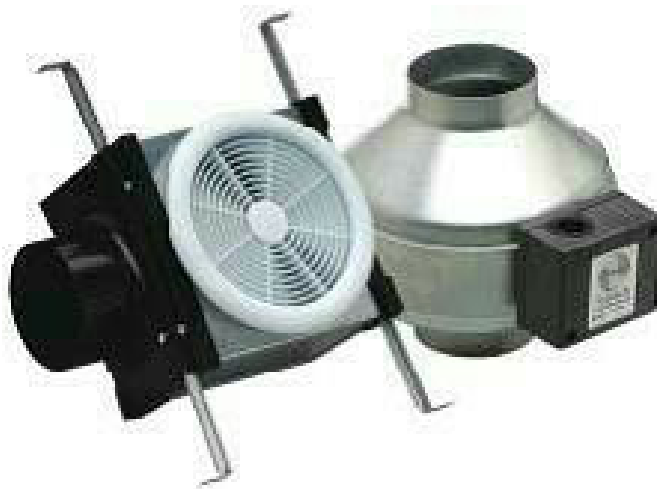
Bath fan and heat lamp