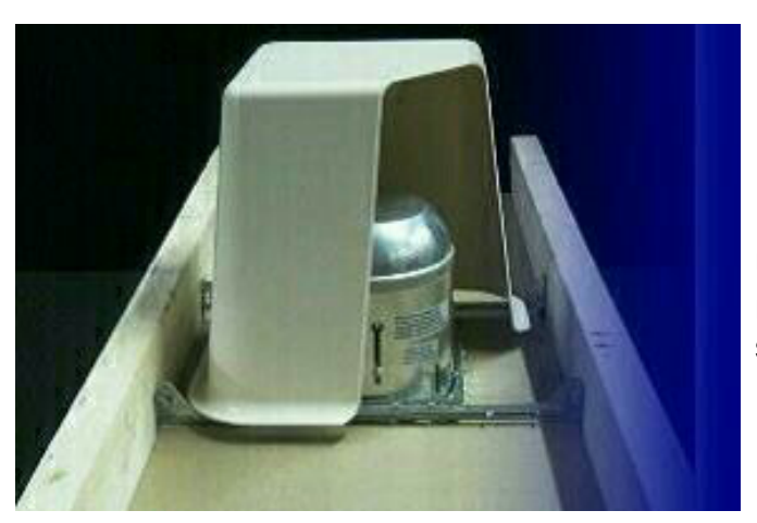
UL/IEC tested Canned Light Covers over recessed lighting to protect light fixtures and stop excess air leakage.

Blown In Cellulose added into attic to improve attic to R49 thermal heat resistance.