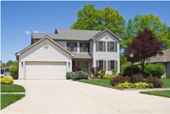
Example of a new concrete driveway