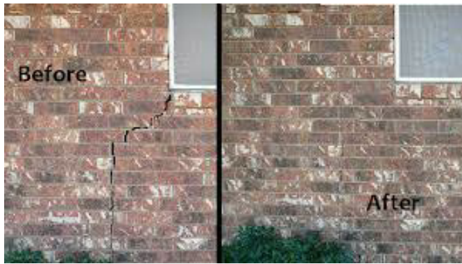
Before and After Foundation Repair