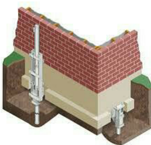
Our foundation repair system diagram