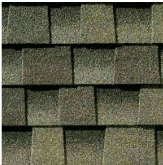
Weathered Wood Asphalt Shingle